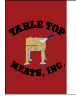
Table Top Meats

815 Box Butte P.O. Box 335 Hemingford, NE 69348