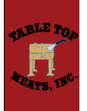
Table Top Meats

815 Box Butte P.O. Box 335 Hemingford, NE 69348